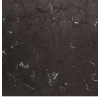
Black White Veins