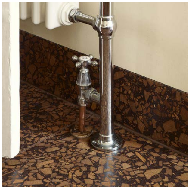
RAL coloured silicone for bathroom flooring Lia Cramer Design Ltd for private residence, London

Our floor tiles are produced with a tongue and groove so are designed to fit together with a shadow gap in the same way as engineered wood flooring products.