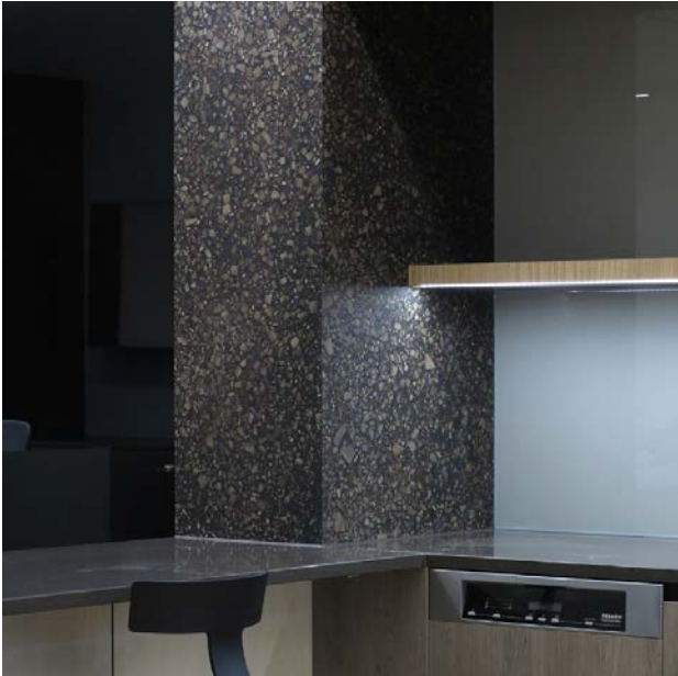
Mitre joined wall cladding with infilled seam MCM Architecture for ITV Studios, London

Mitre joins are a simple and effective way of joining Foresso sheets, and the resulting join should be filled with 2-part filler and sanded to give a seamless effect.