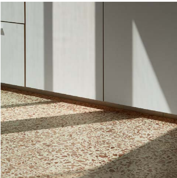
Flexible grout joint between floor tiles Firm-AD for private residence, London

For areas that will be frequently exposed to water the join can be filled with silicone; a variety of colours are commercially available to suit your choice of Foresso.