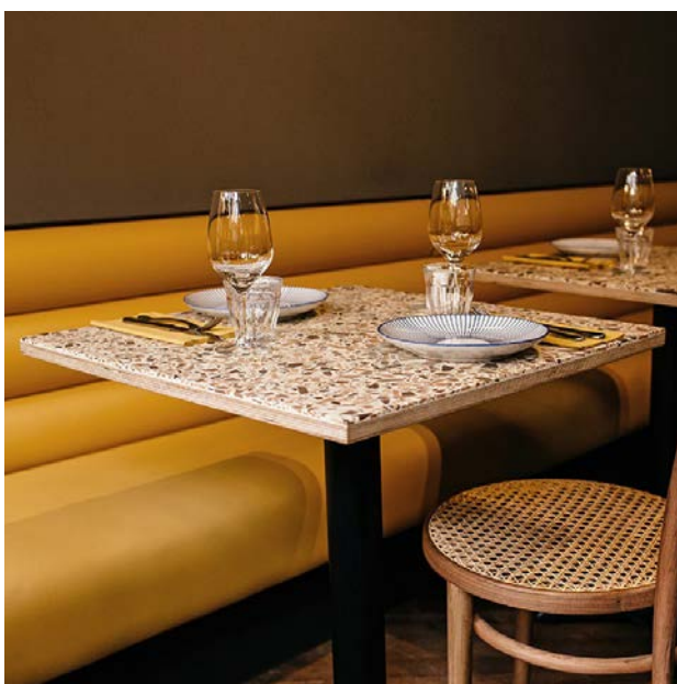
Cut and finished plywood edge JalCoco! for 83 Hanover Street, Edinburgh