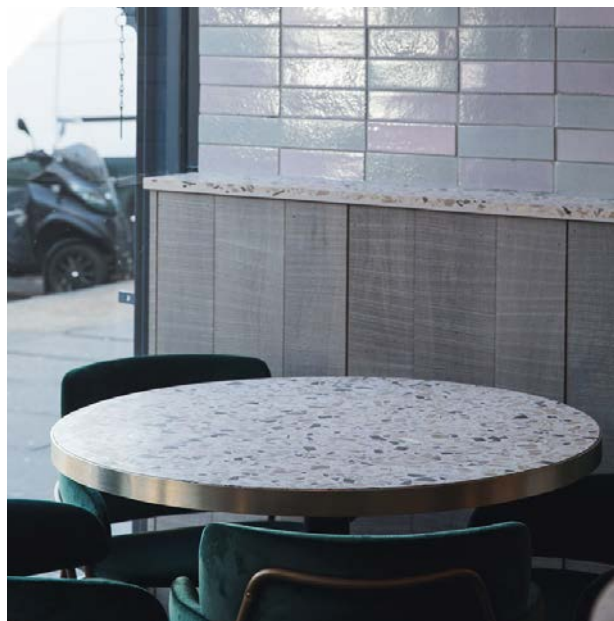
Brass band edge Transit Studio for Sapling, London