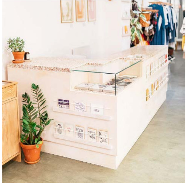
Mitre joined counter with infilled seam Ardour Design for Our Daily Edit, Brighton

For areas that will be frequently exposed to water the join can be filled with silicone; a variety of colours are commercially available to suit your choice of Foresso.