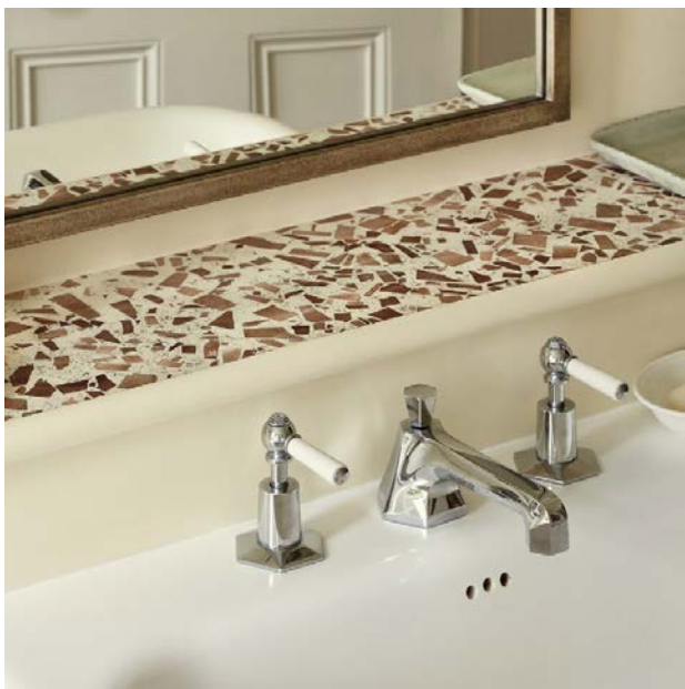
Painted timber bead Lia Cramer Design Ltd for private residence, London

Foresso sheets are supplied with a 'factory' edge, meaning that it is an unsanded, uncut edge. Edges can be cut, sanded, and finished to match the surface, or alternatively they can be edged according to the design intent.