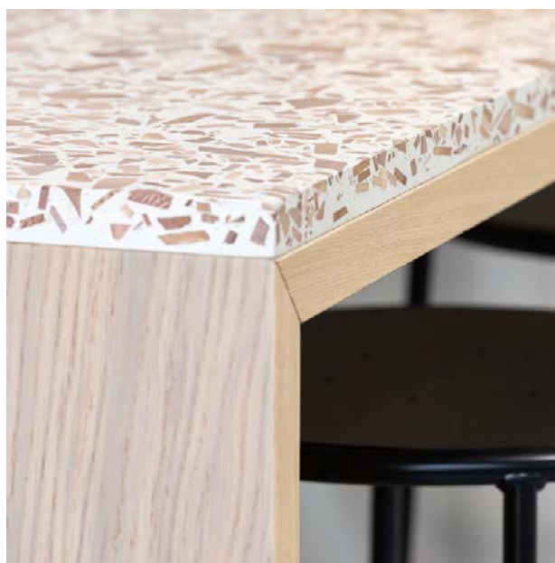
24mm cast Foresso edge Jackdaw Studio for The Beyond Collective

Upcharges apply to 24mm thick cast Foresso edges as they require specialist mould-making and finishing. Please send details of your project to contact@foresso.co.uk to receive a quote.